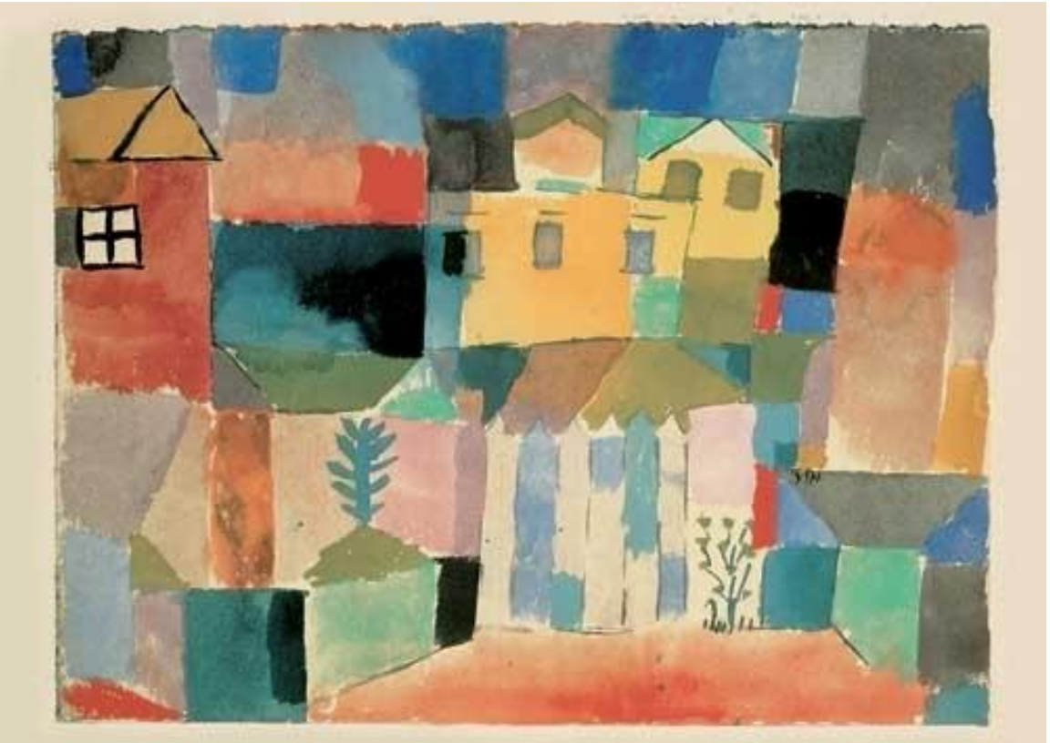
Houses by the Sea by Paul Klee